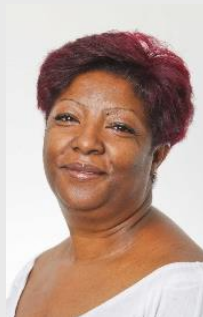
Una Rhooode Creditors